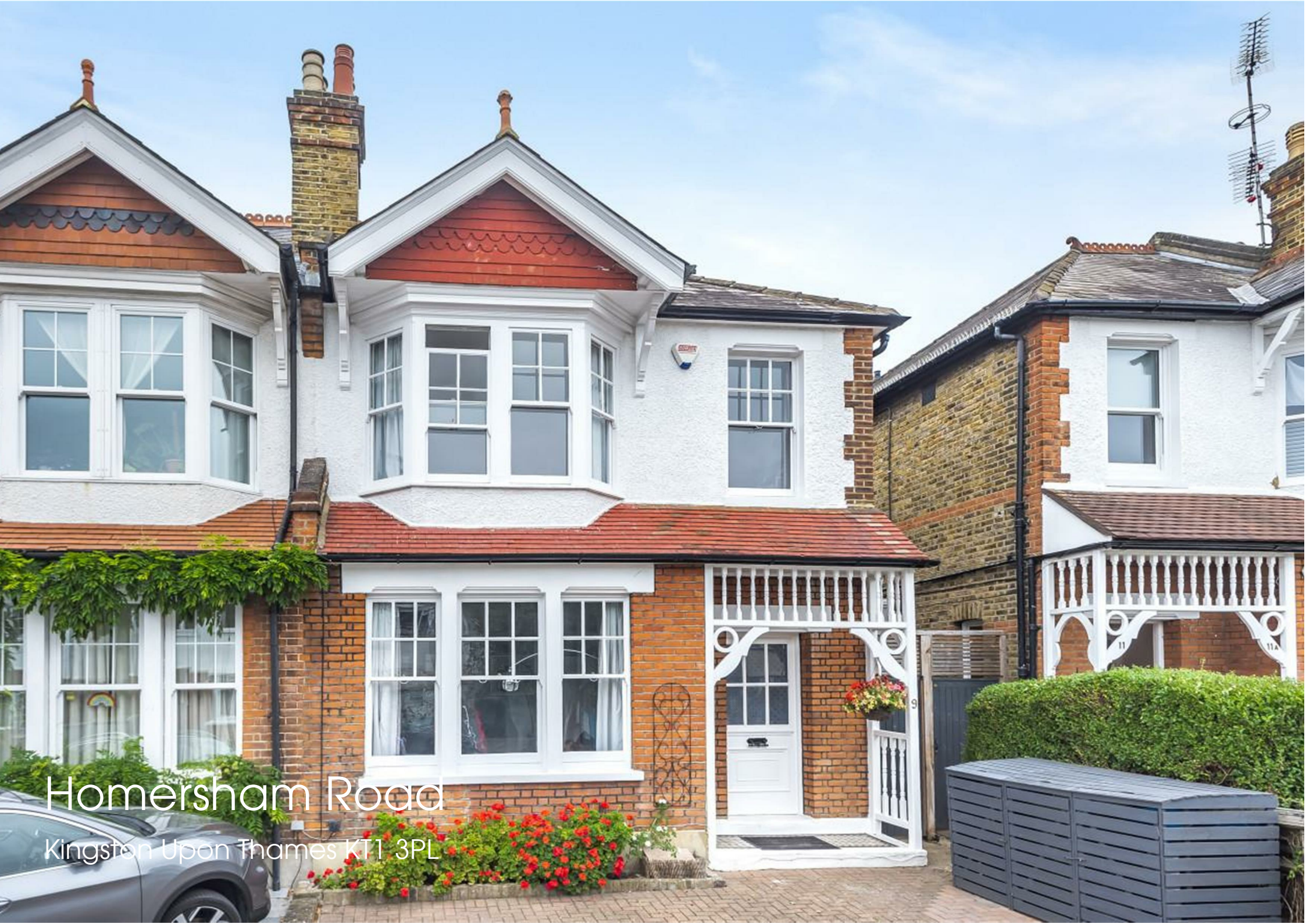
Homersham Road Kingston Upon Thames KT1 3PL